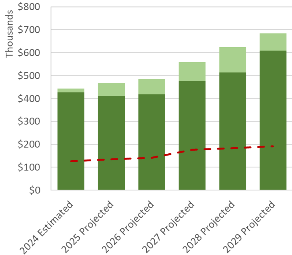
Scenario 1 – No use of Fund Balance