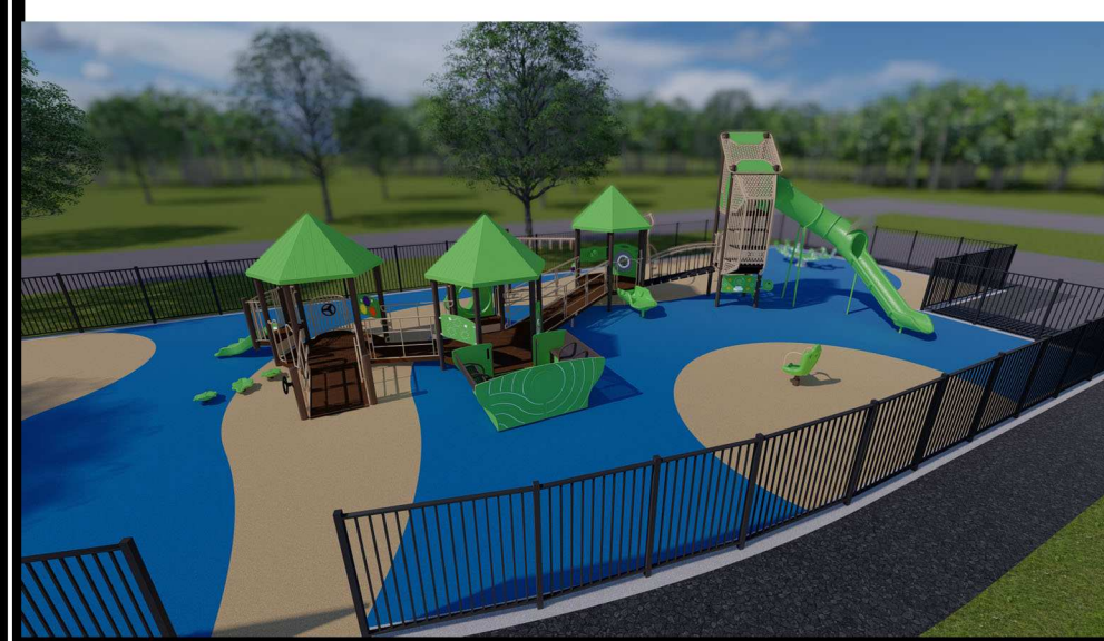
INCLUSIVE JACK'S LAW PLAYGROUND

CAUTION: IF THIS DOCUMENT DOES NOT CONTAIN THE RAISED IMPRESSION SEAL OF THE PROFESSIONAL, IT IS NOT AN AUTHORIZED ORIGINAL DOCUMENT AND MAY HAVE BEEN ALTERED. © COPYRIGHT 2024 BY NEGLIA GROUP. ALL RIGHTS RESERVED.