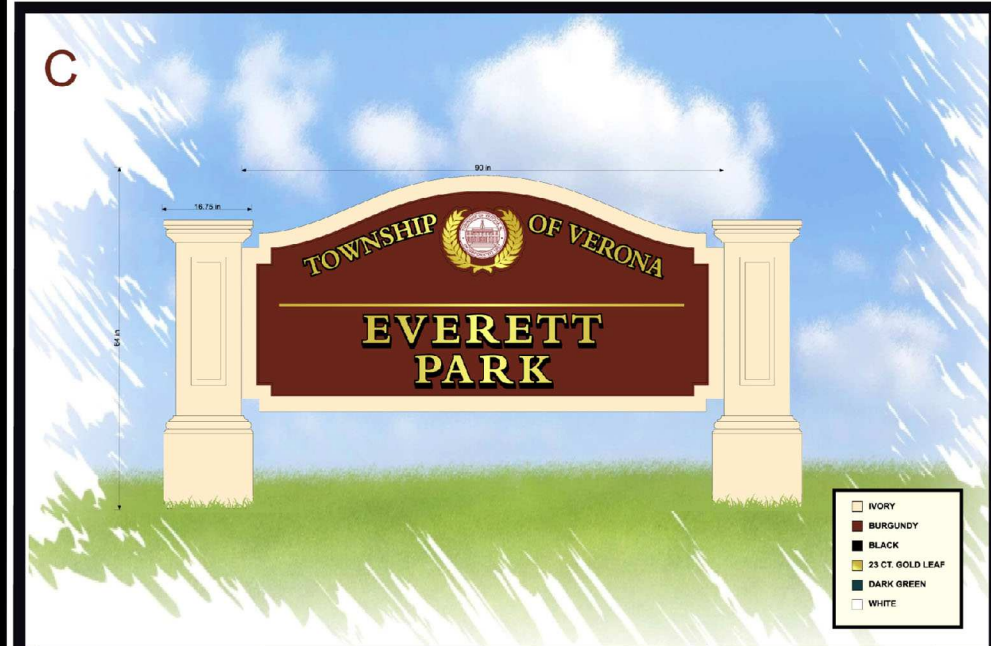
DECORATIVE PARK ENTRANCE SIGNAGE