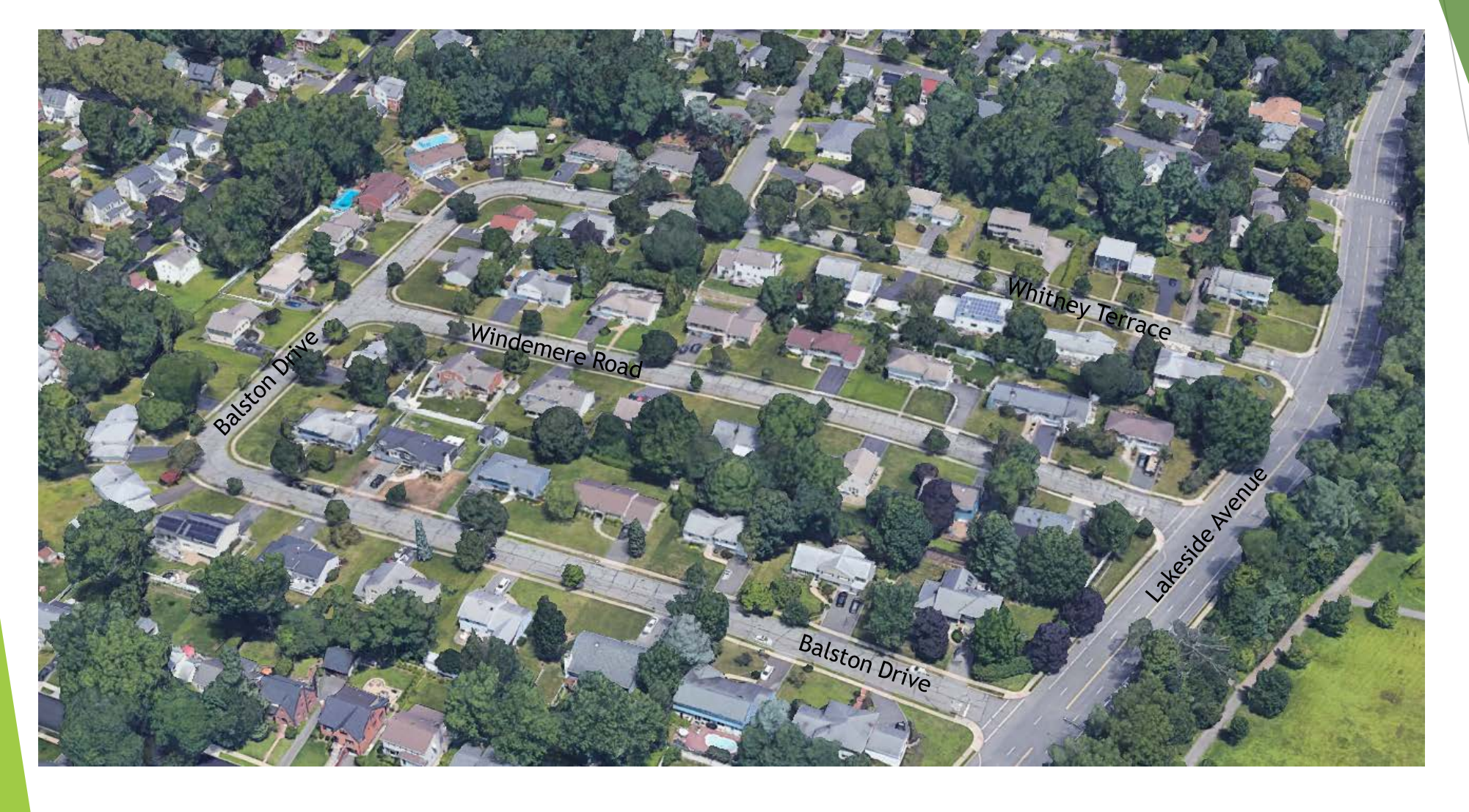
Total Length of all roadways = 0.65 miles or 3,168 linear feet